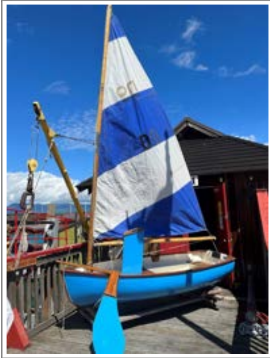
Davidson 9 - $2500

Davidson sailing dinghy in perfect condition. At 9FT it would be an excellent boat to learn to sail.