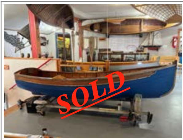
Traditional Lapstrake Dinghy - $3200

Traditional clench nail lapstrake boat. This boat was originally built at the Maritime Centre and raffled off. The owner has since donated it back. Boat is in beautiful shape, could use a light sand and re varnish.