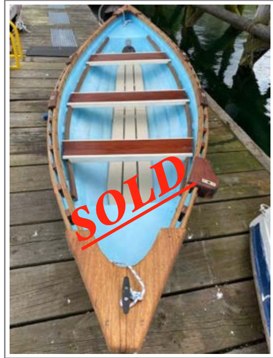
Peapod - $3400

14FT Peapod. Very pretty boat and all ready to go. Comes complete with oars.