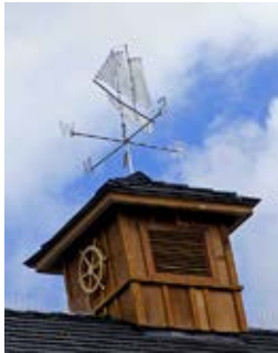
Cupola with weather vane on new pavilion