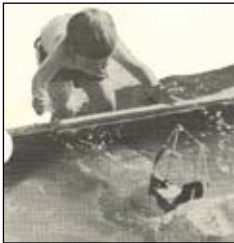
Toy boat building and sailing!

Two wooden hulls donated for restoration