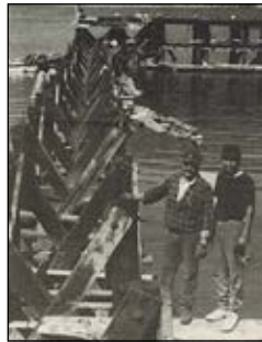
The Pier during renovations