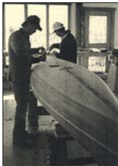
Students learning their craft

$10,000 grant for videos and an interactive computer program