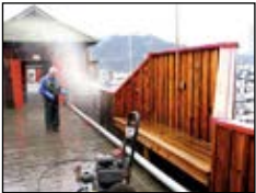
Pressure washing the Pier