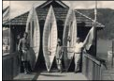
3 of the 4 canoes built in the Airolite Course