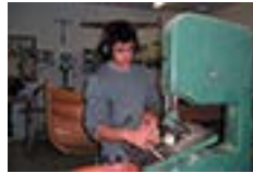
The Shop is busy as usual