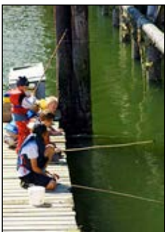
Fishing at the Boat Festival