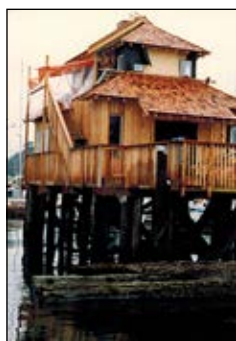
The renovated Pier