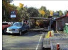
Current street-side building that will be replaced