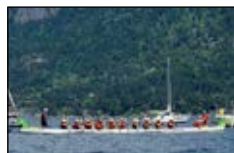
Dragon Divas at the Boat Festival