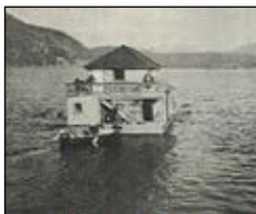
Marine Ecology being towed to new home