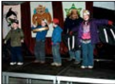
Raven Brings Light to the World