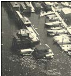
Maritime Centre with Marine Ecology Station barge at the end of the Pier

$10,000 grant for videos and an interactive computer program