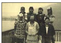
Graduates of first NET class

Gift shop at the end of the Pier converted to an exhibit area for loaned ship models