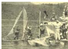
'Fast and Furious' boat building race

2-day 4th Annual Cowichan Bay Boat Festival