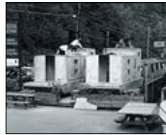
Twin float homes soon ready for launch