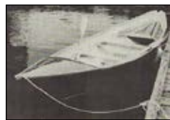
'Strawboss' - 17-foot Swampscott dory