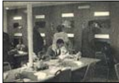
Marine Ecology Station