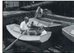
Family boat building teams encouraged