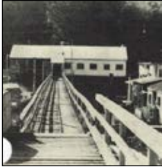
The Pier before renovations

Cowichan Bay Maritime Centre Dream Comes True