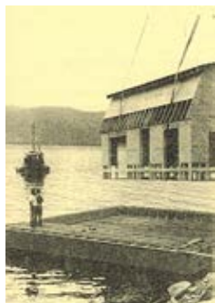
Boat School float home under construction at Bamberton site