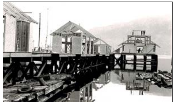
Pier Renovations - December 1988

Renovation of the Pier is well underway.