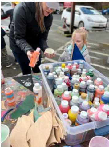
Family Day huge success