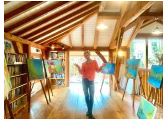
Dominique Eustace art on display