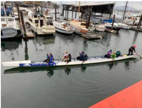
Dragon Boat Season is here