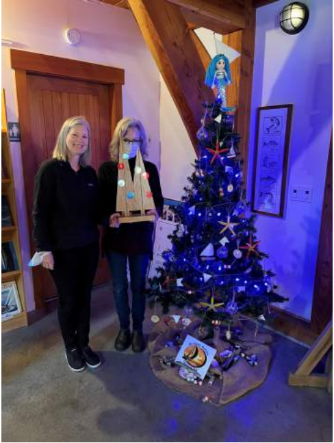
CWBS Christmas Tree Winner 2021 - Bluenose Marina