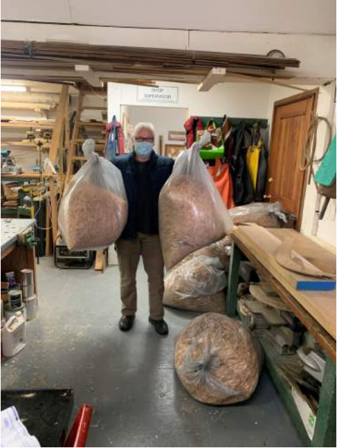
Shavings going to the horses