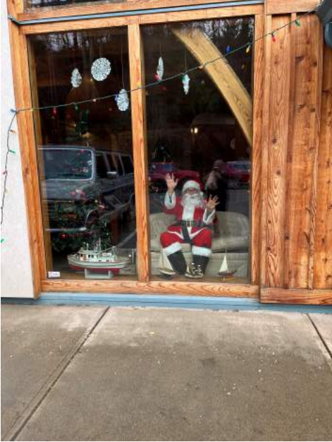
Santa makes an appearance