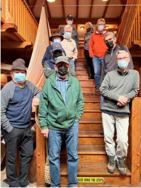
New Board of Directors